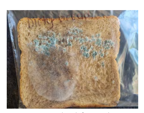
Dirty bread after 1 week