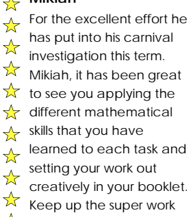
5/6A Mikiah \stackrel{\wedge}{\Rightarrow} investigation this term. \stackrel{\wedge}{\Rightarrow}